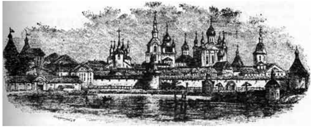
ENGRAVING OF SOLOVKI MONASTERY

And I hear his joyful voice resounded with unvanquishable faith and a flaming, deep desire to glorify Her Who is "More honorable than the Cherubim..."