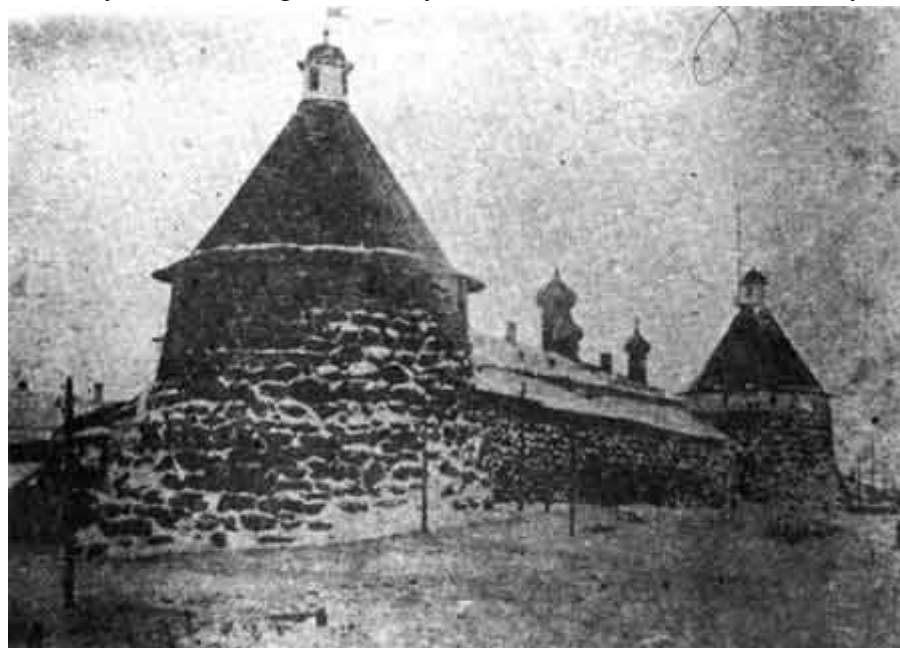
The towers of Solovki Monastery in the winter of about 1930, a Communist concentration camp

The son of a merchant of St. Alexander's Market of Petersburg, he lost his parents early and began to go his own way in life. Being a second-year student of the medical faculty, he became acquainted with and a friend